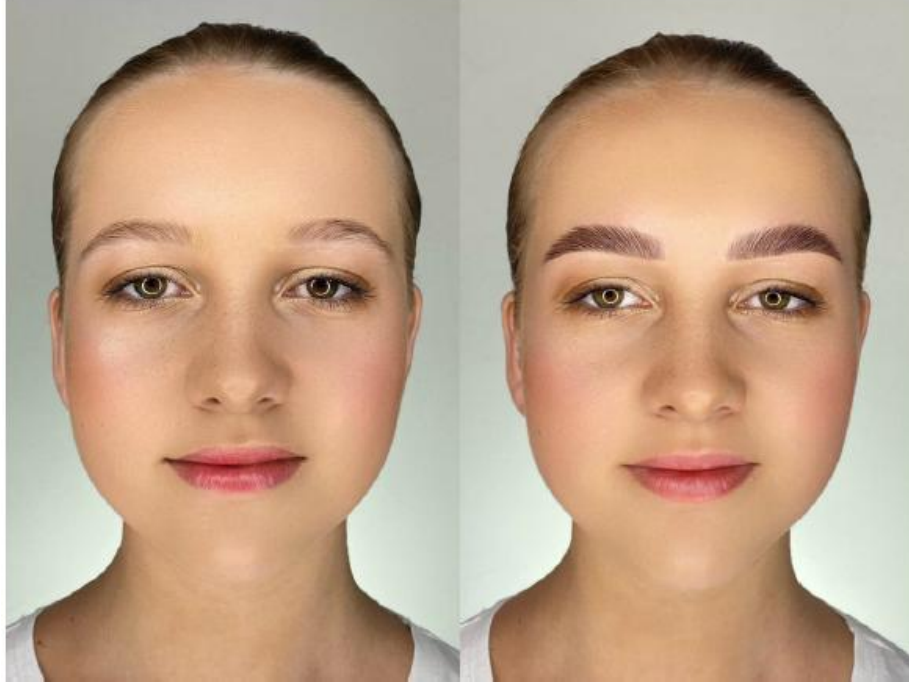
Photo requirements: up to 4 MB, 2 colour photos BEFORE/AFTER, background – WHITE .

The following are prohibited in this category: working on models with permanent makeup, microblading, any type of facial tattoo, or extended eyelashes.